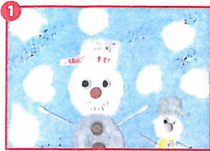
Hope your holidays are filled with merry moments.

Hand-drawn cards by children receiving care at Shriners Hospitals for Children®. All cards have a picture of the child artist on the back with a short biography, a statement about Shriners Hospitals for Children® and an explanation of the Daughters of the Nile.