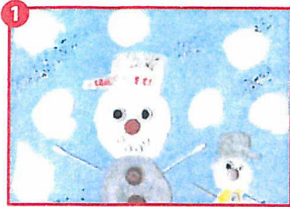
Hope your holidays are filled with merry moments.

Hand-drawn cards by children receiving care at Shriners Hospitals for Children®. All cards have a picture of the child artist on the back with a short biography, a statement about Shriners Hospitals for Children® and an explanation of the Daughters of the Nile.