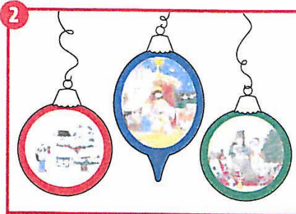
CELEBRATE ALL THE JOYS OF THE SEASON!