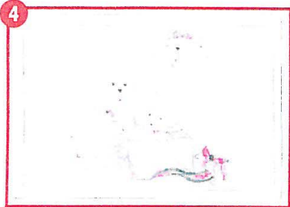
May your Holidays be wrapped in beautiful blessings and may the spirit of Christmas linger long in your heart.