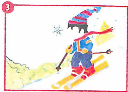
May the Holidays be happy days for you and yours!