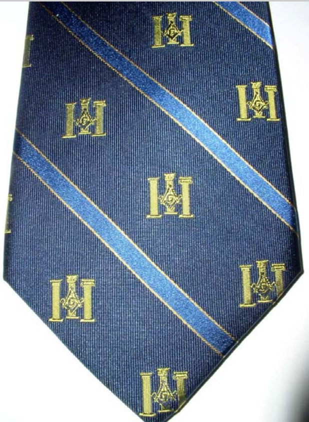
Tie $30.00. 100% Silk