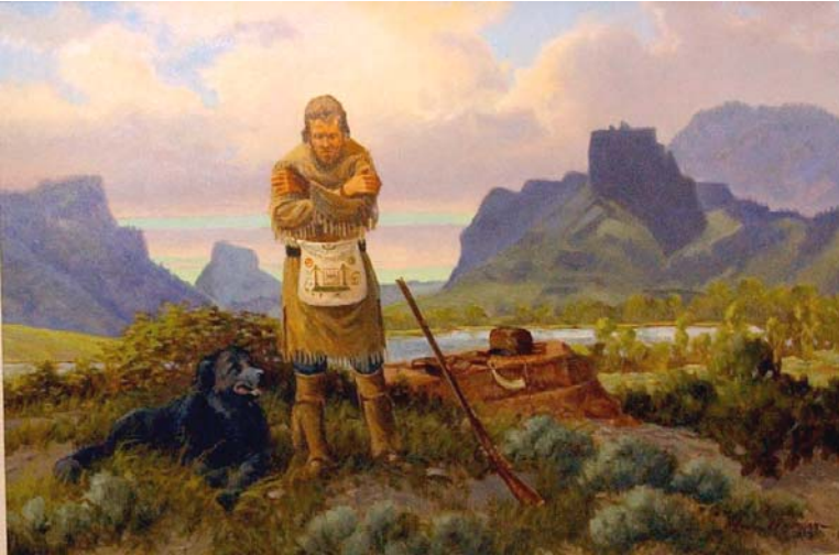
At Prayer on the Journey West Meriwether Lewis July 15, 1805