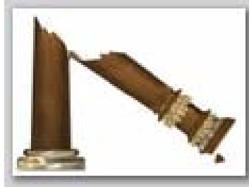
Symbol of the passing of a member of the craft